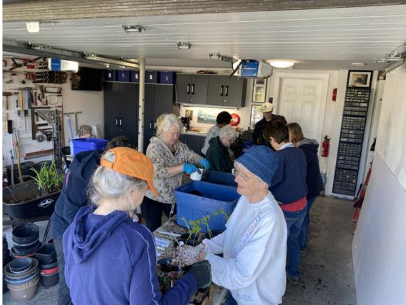
Potting up May 10th