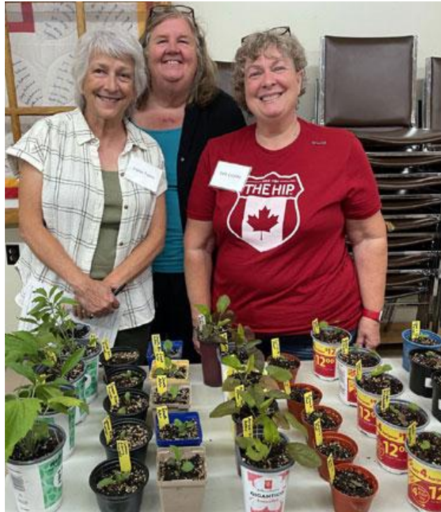
Climate Change and Biodiversity Group's plant giveaway was awesome!

A Native Plant Giveaway was held, offering each member in attendance the opportunity to take home at least two plants for their gardens. Additionally, several established native plants were awarded as door prizes.