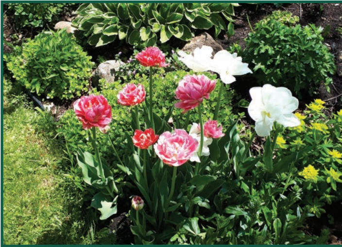
Tulips in my garden from last year.

"A garden comes from the heart of the person planting it."