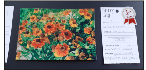
Class 1: Flowers: Susan Burke