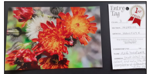
Class 3: Invasive: Rob Drapeau