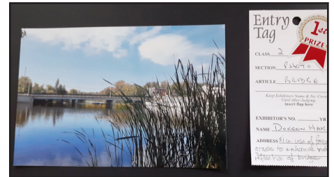
Class 2: Bridges: Doreen Harris